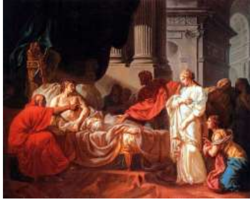
Antiochus and Stratonice. In this painting, Jacques-Louis David (1748-1825) depicts the moment in which Erasistratos diagnosed Antiochus' love for his stepmother. École des Beaux-Arts at Paris.

Plutarch (1 st century, A.D./1920), more medically oriented, detailed Antiochus' symptoms: