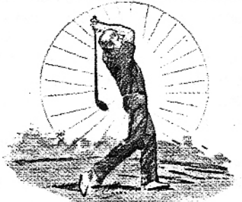
During the 19th century early golf balls were made of leather bags stuffed with feathers and sewn closed. The longest measured drive was 175 yards.

A scotch whisky with an Italian name? In 1749, Giacomo Justerini followed a voluptuous opera singer to London and stayed to found the firm of Justerini and Brooks—purveyors throughout the world of one of life's more pleasurable participation events.