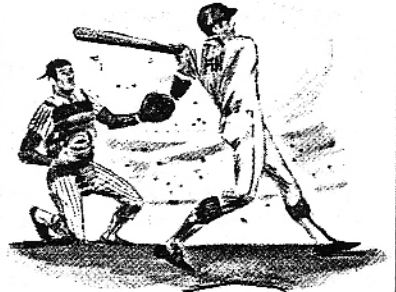
On July 10, 1929 the Philadelphia Phillies and Pittsburgh Pirates played a game in which there was a home run hit in every inning.

86 Proof Blended Scotch Whisky © 1973 Paddington Corp., N.Y.