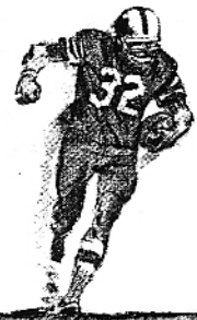
A football game was played between Washington State College and San Jose State College in 1955 that was attended by only one paying customer in near zero temperature.